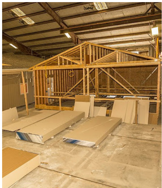
Example of modular home under construction, Advanced Systems Homes located in Chanute, KS.

There are currently modular home builders in the area who have built homes in Allen County. These are homes constructed with traditional stick-built methods but in a climate-controlled, factory setting. The finished product is then moved and assembled on the site of the customer's choosing. One of the major benefits of this construction method is having a central location for construction crews to work instead of traveling to each site.