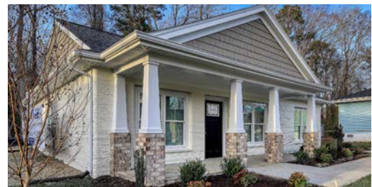
Alquist 3D's completed pilot home in Williamsburg, VA with exterior walls constructed using 3D printing technology