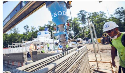
Example of 3D printing technology

Alquist 3D , a partner of Atlas Community Studios, collaborated with the Virginia Center for Housing Research at Virginia Tech (VCHR) and Virginia Housing to design and construct the nation's first owner-occupied 3D printed home located in Williamsburg, VA. Habitat for Humanity Peninsula and Greater Williamsburg provided the financial support to build this pilot project. Alquist has plans to continue building 3D homes emphasizing rural communities throughout the Midwest.